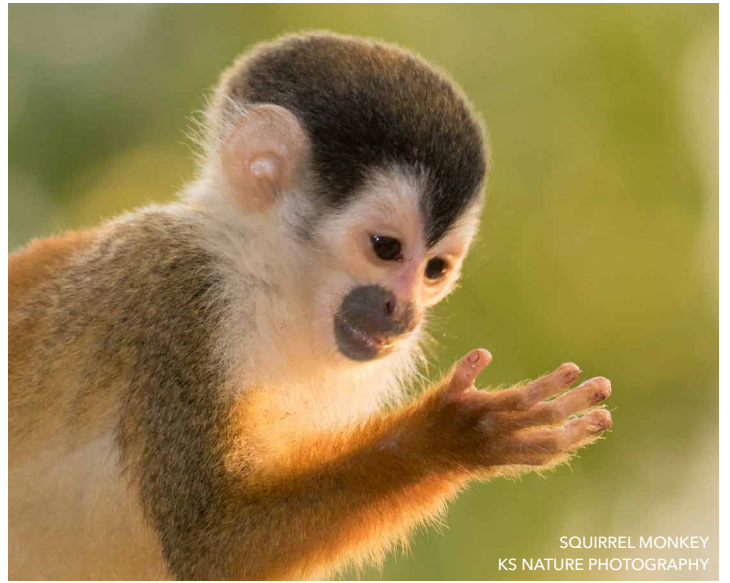
SQUIRREL MONKEY KS NATURE PHOTOGRAPHY