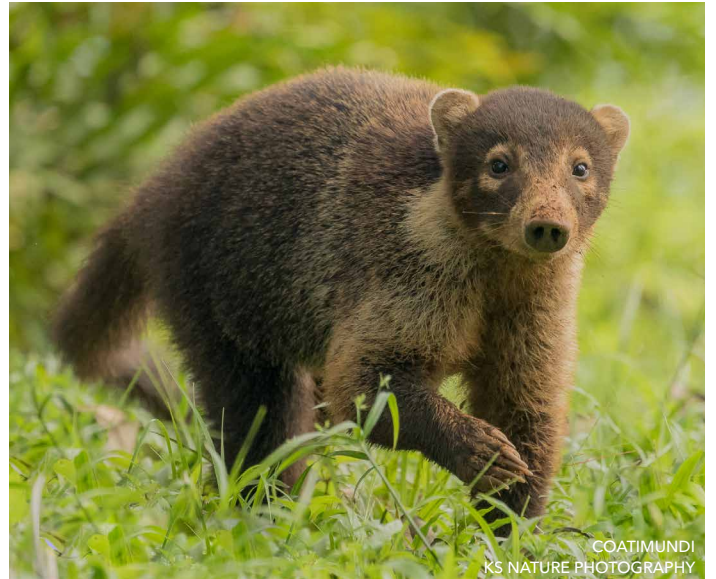
COATIMUNDI KS NATURE PHOTOGRAPHY