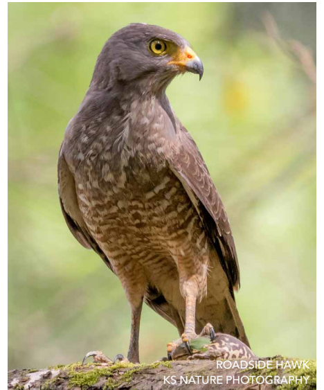
ROADSIDE HAWK KS NATURE PHOTOGRAPHY