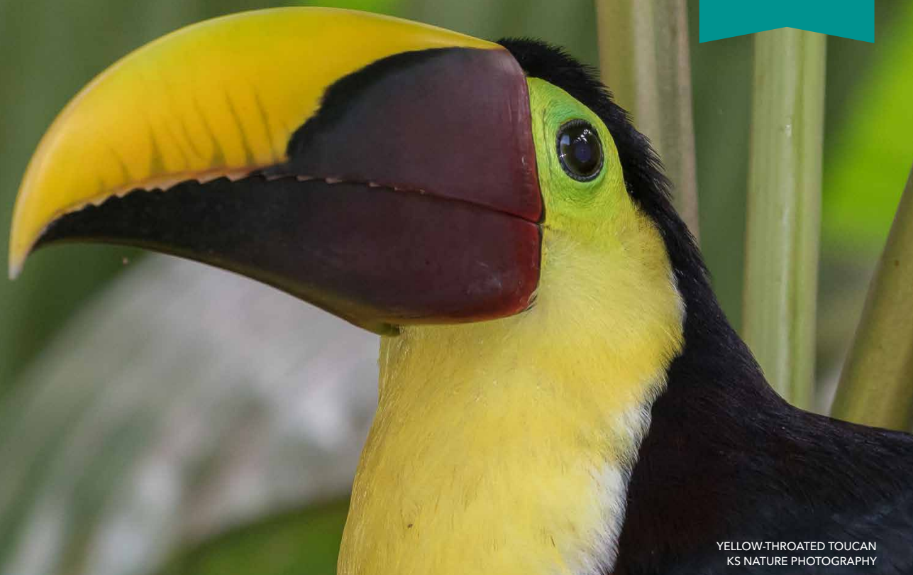
YELLOW-THROATED TOUCAN