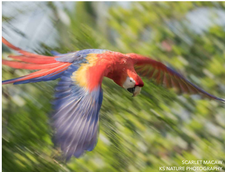
SCARLET MACAW KS NATURE PHOTOGRAPHY