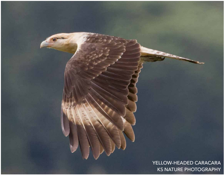
YELLOW-HEADED CARACARA