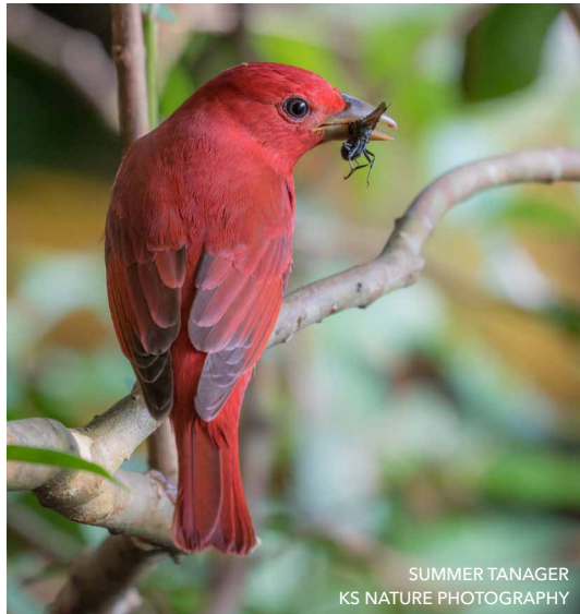
SUMMER TANAGER KS NATURE PHOTOGRAPHY